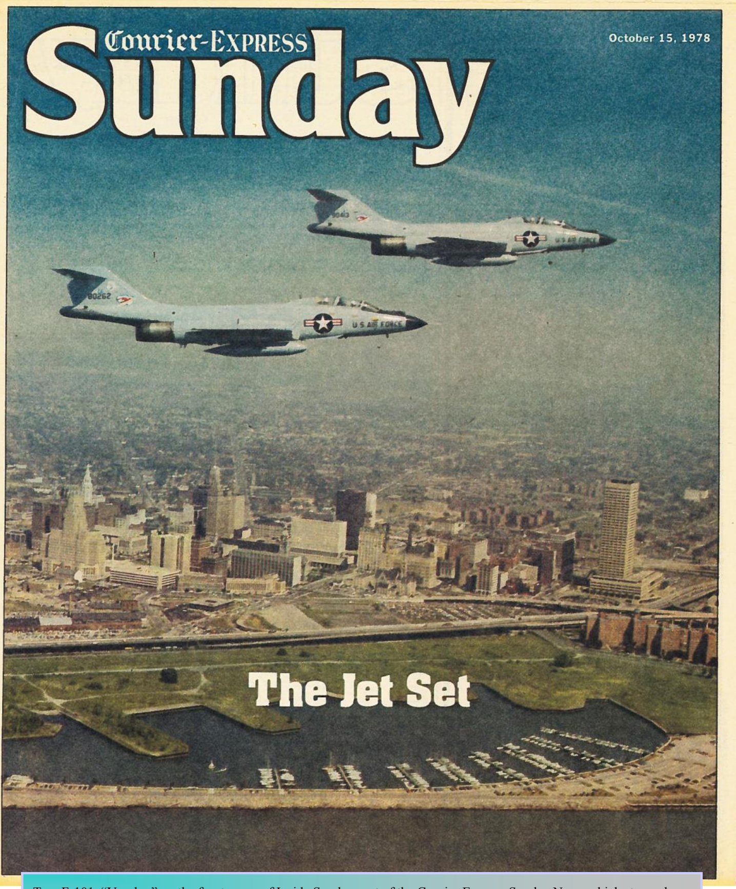
Two F-101 "Voodoo" on the front cover of Inside Sunday part of the Courier Express Sunday News which stop publishing in 1982. Buffalo had two newspapers then. At that time, the 107th was part of the North American Air Defense Command (NORAD).